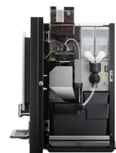
OB 3 (XL) Touch