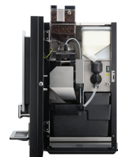
OB 2 (XL) Touch